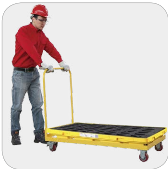
2-drum spill pallets with stackable structure save space and transportation costs