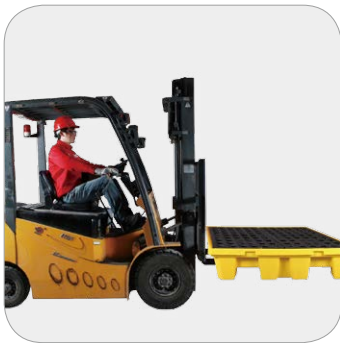
2-drum and 4-drum spill pallets have forklift slots for convenient forklift operation to improve efficiency (*forklift overload prohibited)