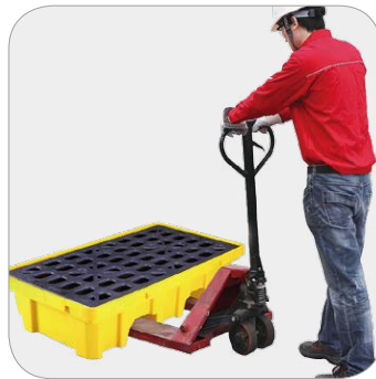
Hydraulic carrying vehicles can also be used to move pallets, which is more convenient