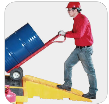
Poly spill pallet ramps make it easier to move large articles