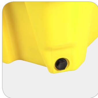
Hexagonal drain plug facilitates drainage