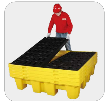
2-drum and 4-drum spill pallets with stackable structure save space and transportation costs