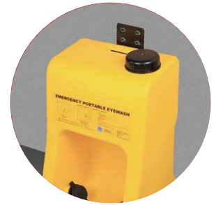
Able to be hanged on the wall, space saving.