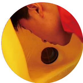
Long flushing time above ANSI standard.