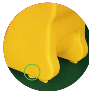
Easily discharge water in tank with the drainage hole at the base.